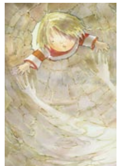
Cover and illustration from The Little White Sprite .